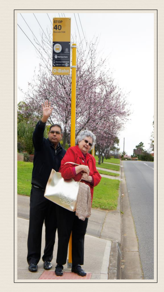
Public transport made easy